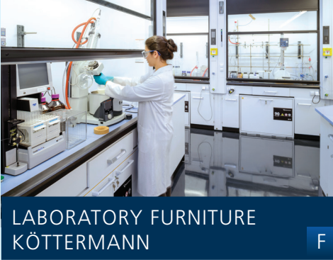
LABORATORY FURNITURE KÖTTERMANN