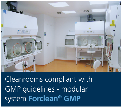
Cleanrooms compliant with GMP guidelines - modular system Forclean® GMP