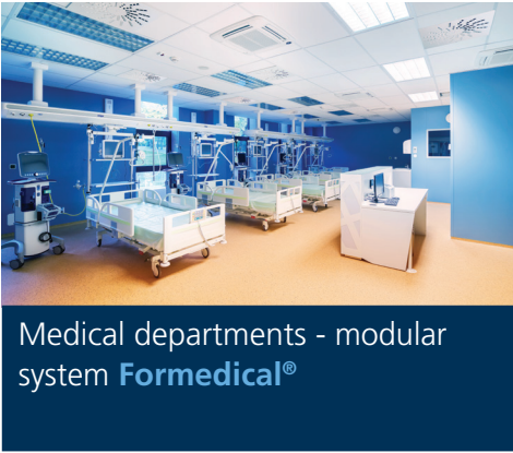
Medical departments - modular system Formedical®